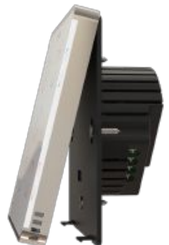
Figure 3: Install Touch Panel Unit

Note: Zero-Cross technology is unavailable if the device operates using DC voltage (24-48VDC).