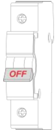
Figure 1: Circuit Breaker

Note: HELTUN recommends installing cord terminals (electric wire ferrule) on the ends of wires before connecting them to the HE-TPS05 outputs (various colors terminals are included in the packaging).